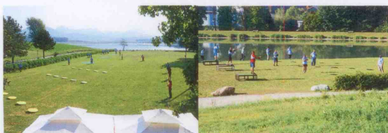
Fishing home (New casting competition center)