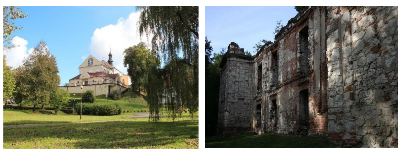
Late Renaissance Saint John the Baptist church seen from the park

In 1900 Bychawa had 2,800 inhabitants, including 2,294 Jews who constituted 81% of the total population of the town, as a result of Russian discriminatory regulations. In the second half of the 1930s, due to the worsening economic situation and intensifying anti-Semitic atmosphere, the situation of Jews in Bychawa was systematically declined, which led to the increase in emigration rate. On the eve of the outbreak of World War II, Jewry made up only a half of the entire population in Bychawa. The Germans created a ghetto in Bychawa in December 1940 during World War II and around 2,600 Jews lived in the ghetto in 1942. Jews from Bychawa were transported to the ghetto in Bełżyce and then to the Sobibor extermination camp on 11 October 1942. Apart from regular mass exterminations in Bełżec, the Nazis also carried out individual executions around the town.<sup>[3]</sup>